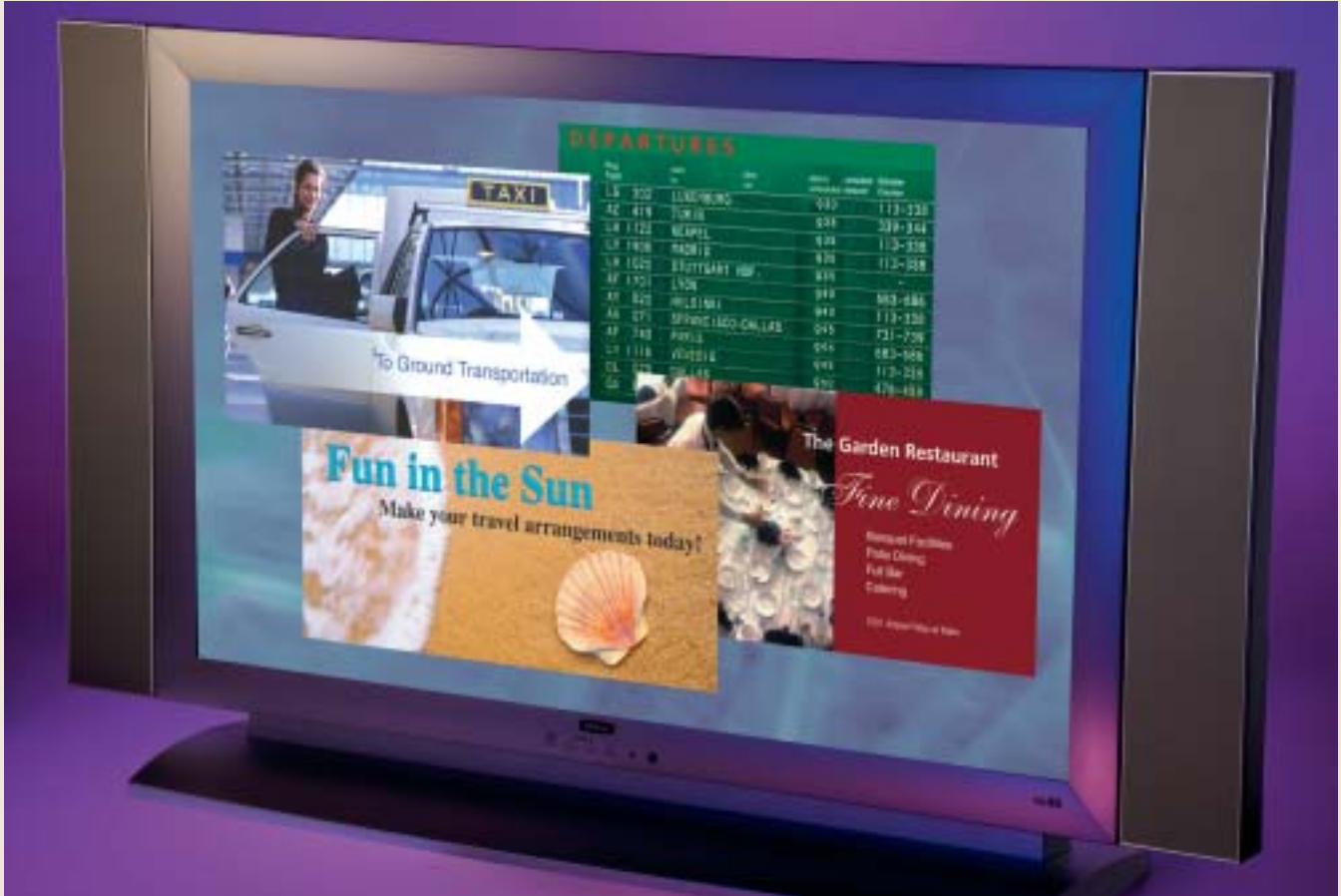
*Image shown with optional detachable speakers and table stand.